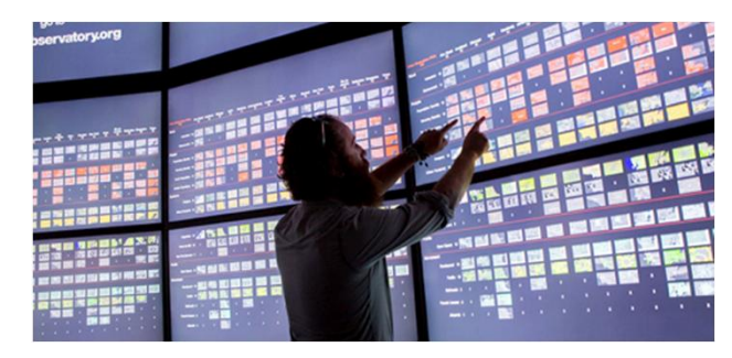
Data Analytics & Decision Making